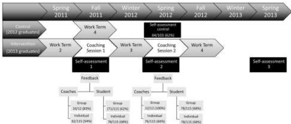
FIGURE 1: Timeline of coaching and assessment activities for both the intervention and control arms in the coaching program.

A timeline of study activities and assessment collection points is provided in Figure 1. A few surveys and feedback forms were provided in hard copy form, which were transcribed into appropriate electronic forms by the research coordinator.